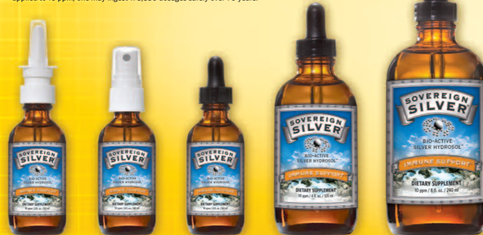
2 fl. oz. / 60 ml Vertical Spray

† According to the EPA (CASRN 7440-22-4) daily Oral Silver Reference Dose (RfD) applied to 10 ppm, one may ingest 178,850 dosages safely over 70 years.