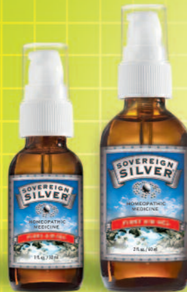
1 fl. oz. / 30 ml First Aid Gel

Keep one bottle in your bathroom cabinet, one in your car, and one in your purse or briefcase, so you'll always be prepared for life's little accidents.